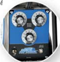
Throwing Wheel Dials