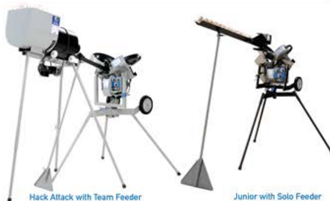
Hack Attack with Team Feeder

Junior Hack Attack Conversion Kit enables the Junior Hack Attack to throw 7.5" undersized balls for vision training.